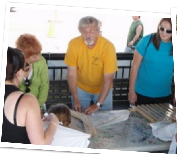
Revere Beach Festival

01/30/10 Texas - 10th Annual SPI Kite Fest Detail